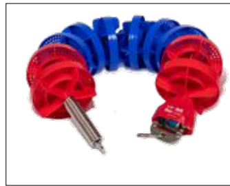
1010002 Racing Lane Line Malmsten Gold Ø 150 m