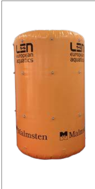
1310013 Open water buoy - Large