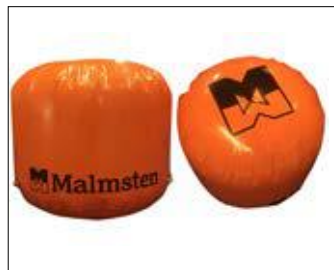
1310014 Open water buoy - Small