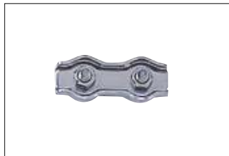
1011011 Wire lock