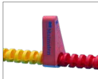
1514021 Cones – Field Line