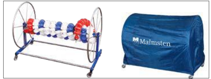
1012001 Storage Trolley for Lane Line Malmsten 1050006 Cover for Malmsten Storage Trolley