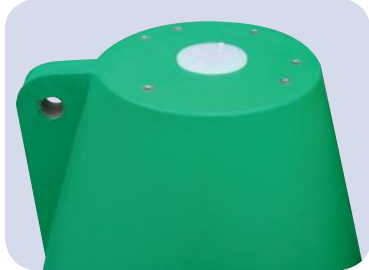
Moulded-in stainless steel lifting eyes in the SL-AQF800-CAN and SL-AQF800-CONE buoys enable ease of maintenance and servicing