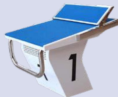
Starting block Malmsten PRO with Track Start