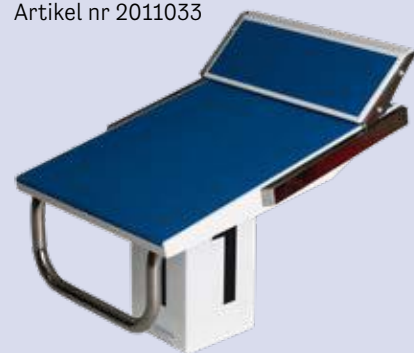
Starting block Malmsten Classic with Track Start