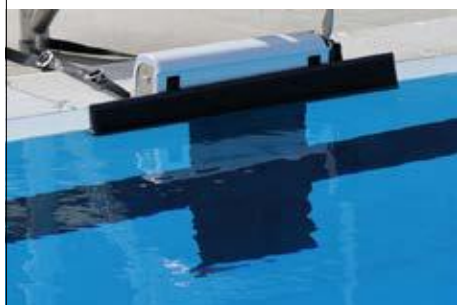
Backstroke starting device, article no. 1910054

Short strap = Fits malmsten starting blocks Long strap = Required for certain models