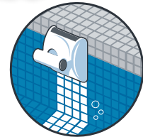
Water line Cleaning