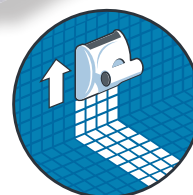
Floor & Wall Cleaning