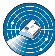
CleverClean scanning system